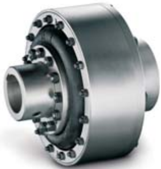
Highly flexible couplings Pages 10–11