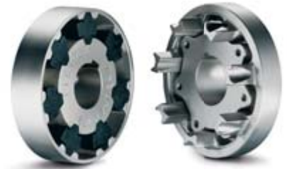
Torsionally flexible couplings Pages 8–9