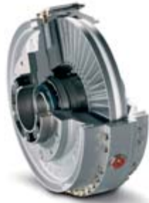
Fluid couplings Pages 12–13