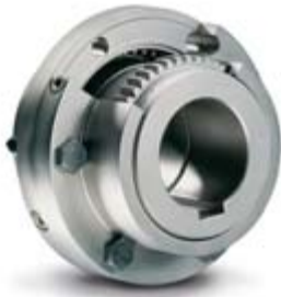
Torsionally rigid gear couplings Pages 4–5