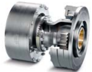
Couplings for railway vehicles Pages 16–17