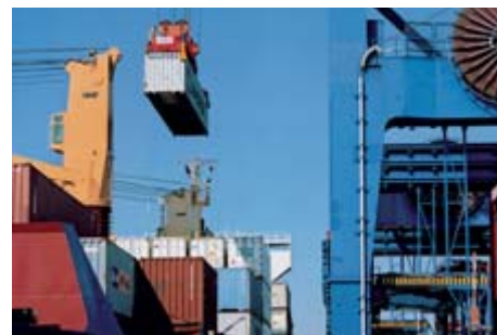
High loads and great differences in temperatures are the challenging conditions for our flexible couplings.