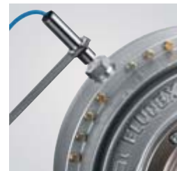
A thermal operating control system prevents overheating of the FLUDEX coupling.