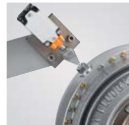
The specified operating condition of a FLUDEX coupling can be monitored by a non-contacting and maintenance-free EOC system.