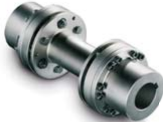
Torsionally rigid all-steel couplings Pages 6–7