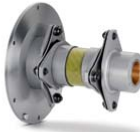
Couplings for wind turbines Pages 14–15