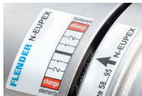
Simple examination of the condition of the flexible element in the N-EUPEX coupling by wear indicator.

We also offer many series covering special customer needs. In addition to couplings connecting flange and shaft, variants with brake disc or brake drum are also frequently required.